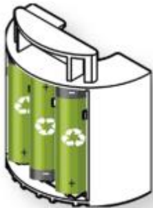
18650 Battery Case