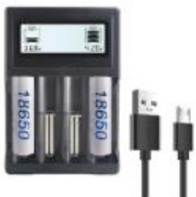
battery recharger not supplied

It is not supplied with products. Customers need to purchase their own charger to recharge the battery. (The charger as follows :)